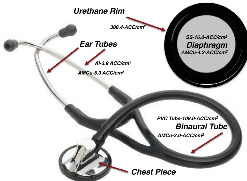
Fig 1. Antimicrobial copper reduced the concentration of bacteria on stethoscope surfaces. Four surfaces associated with a control Master Cardiology Stethoscope or an intervention stethoscope fabricated from AMCu alloys were sampled and assessed for the presence of bacteria as described in the methods. The total ACCs were determined as described in the methods. The mean microbial burden observed for individual stethoscopes with either SS cast bells (chest piece) or a bell cast from C87610 silicon bronze alloy and the respective mean values observed from 3 stethoscope surfaces (ear tubes, binaural tube, and diaphragm) are described. ACC, aerobic colony count; Al, aluminum; AMCu, antimicrobial copper alloy; PVC, polyvinyl chloride; SS, stainless steel.

The control instrument was a 3M Littmann Master Cardiology Stethoscope (3M Littmann, Brookings, SD) and was fabricated from stainless steel (chest piece), polyvinylchloride (PVC) tubing (binaural), aluminum (flexible ear tubes), G-10 epoxy (diaphragm), and urethane (snap on rim). The device used in the intervention arm of the trial was identical in design to the control instrument but was custom fabricated from antimicrobial copper alloys as defined by the U.S. Environmental Protection Agency. The alloys were C87610, silicone bronze (chest piece), and C70600, copper nickel (ear tubes, braiding over the PVC binaural tubing, and diaphragm). The sound performance of the copper diaphragm was sufficient to qualify the device as a stethoscope (Fig 1).