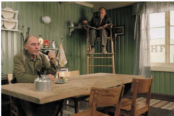
Kitchen Stories (2003, Norway)

In this course students learn the methodology of cultural anthropology by both thinking about and doing ethnography. The course is structured to give students a working knowledge of research ethics, participant observation, qualitative methods, project design, interviewing skills, and ethnographic data analysis and writing. While reading and discussing different approaches to ethnography in the classroom, students will also conduct an ethnographic research project outside of the classroom. Students will work on their projects in class workshops and present their findings at the end of the course.