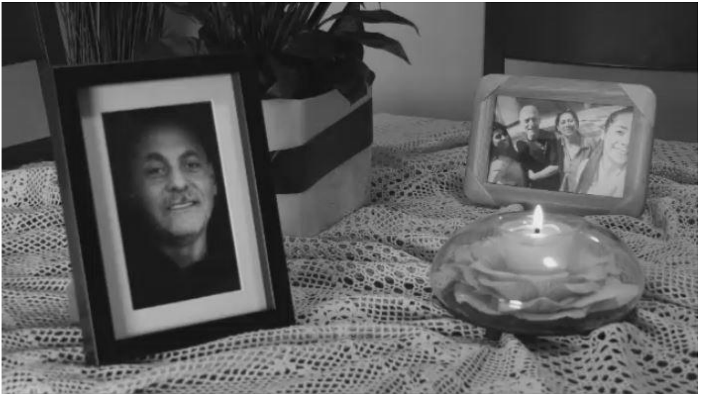
Family remembers man killed by falling bricks during windstorm in Parc Ex