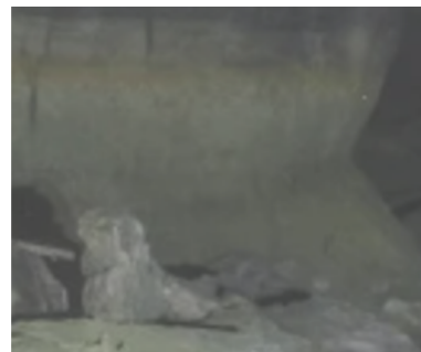
Answer: The inside of a cave

Take a look at the picture below, can you tell what it is a picture of?