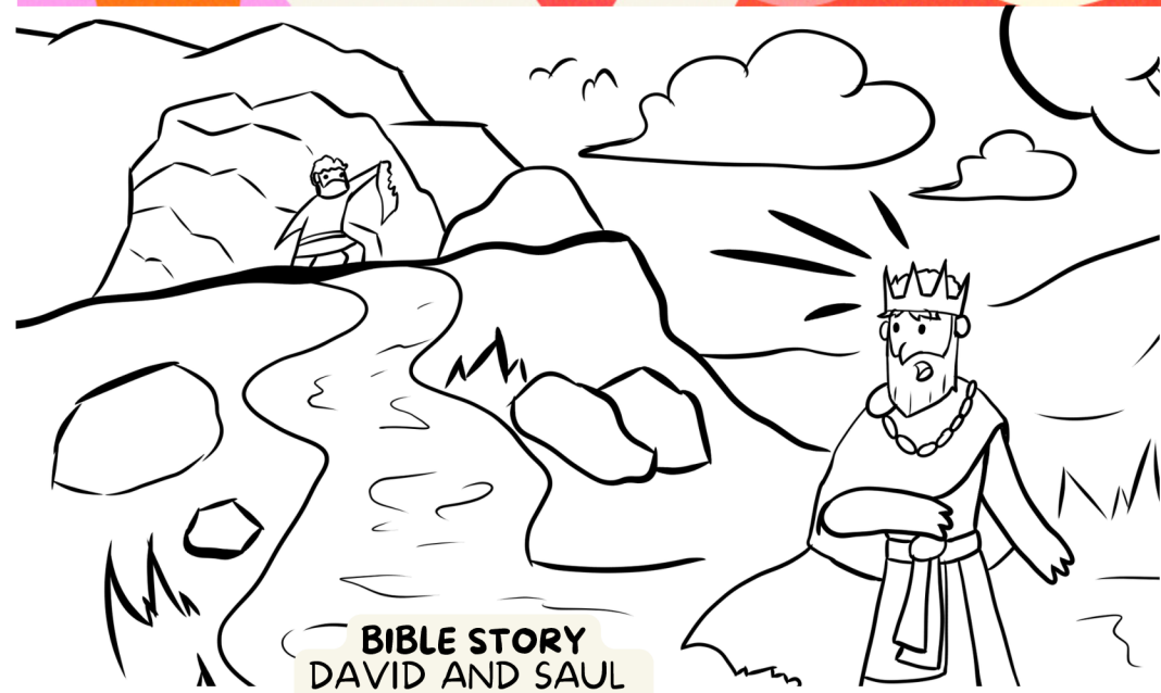
BIBLE STORY DAVID AND SAUL 1 SAMUEL 24

I AM MOTIVATED TO LIVE WITH SELF-CONTROL