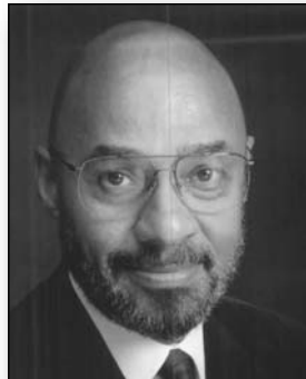
Honorable Dennis W. Archer

The WCBA is pleased to announce that the the Hon. Dennis W. Archer, Past President of the Amercian Bar Association, will be the featured speaker at our 107 th Annual Banquet which will take place on Wednesday, May 18, 2005 at the Westchester Marriott in Tarrytown. This year, by popular request, the open bar reception has been extended and begins at 6:00 p.m., and dinner will be served at 7:30 p.m. We pledge to keep the speeches short and adjourn by 9:00 p.m.!