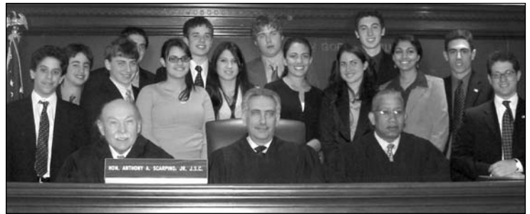
And the winner is... Blind Brook High School.