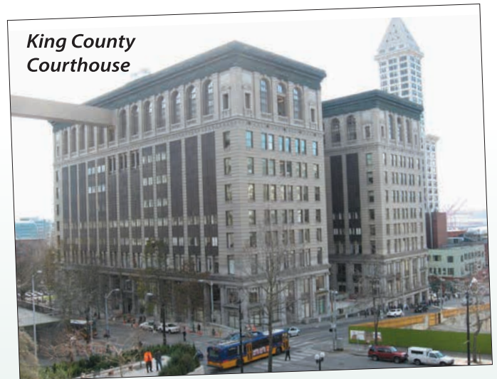
King County Courthouse