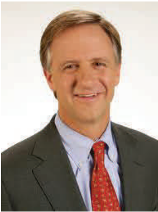
Gov. Bill Haslam (2011-present)

Howard H. Baker Jr. Center for Public Policy, University of Tennessee