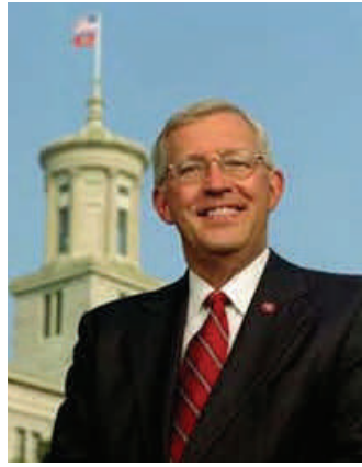
Gov. Don Sundquist (1995-2003)