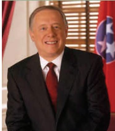
Gov. Phil Bredesen (2003-11)