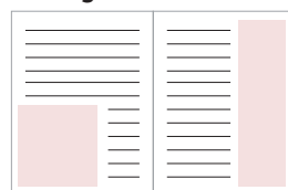
5" w x 5" H 2.5" w x 10" H