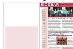
7.5" w x 5" H