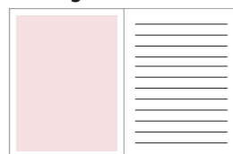
7.5" w x 10" H