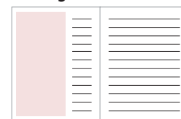
5" w x 10" H