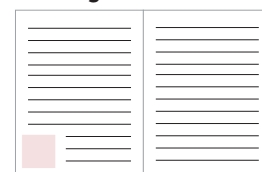
2.5" w x 2.5" H