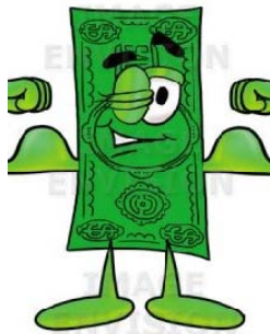
Make your money work for you