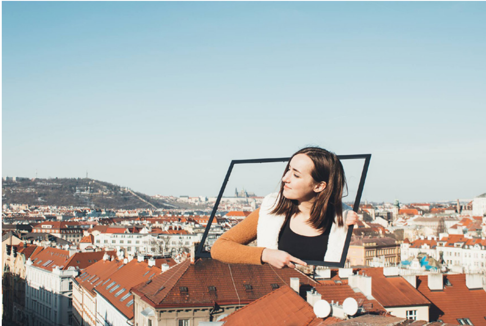
Photograph by Ludmila Borošová