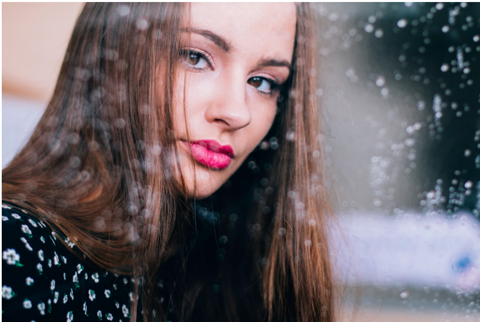
Photograph by Ludmila Borošová