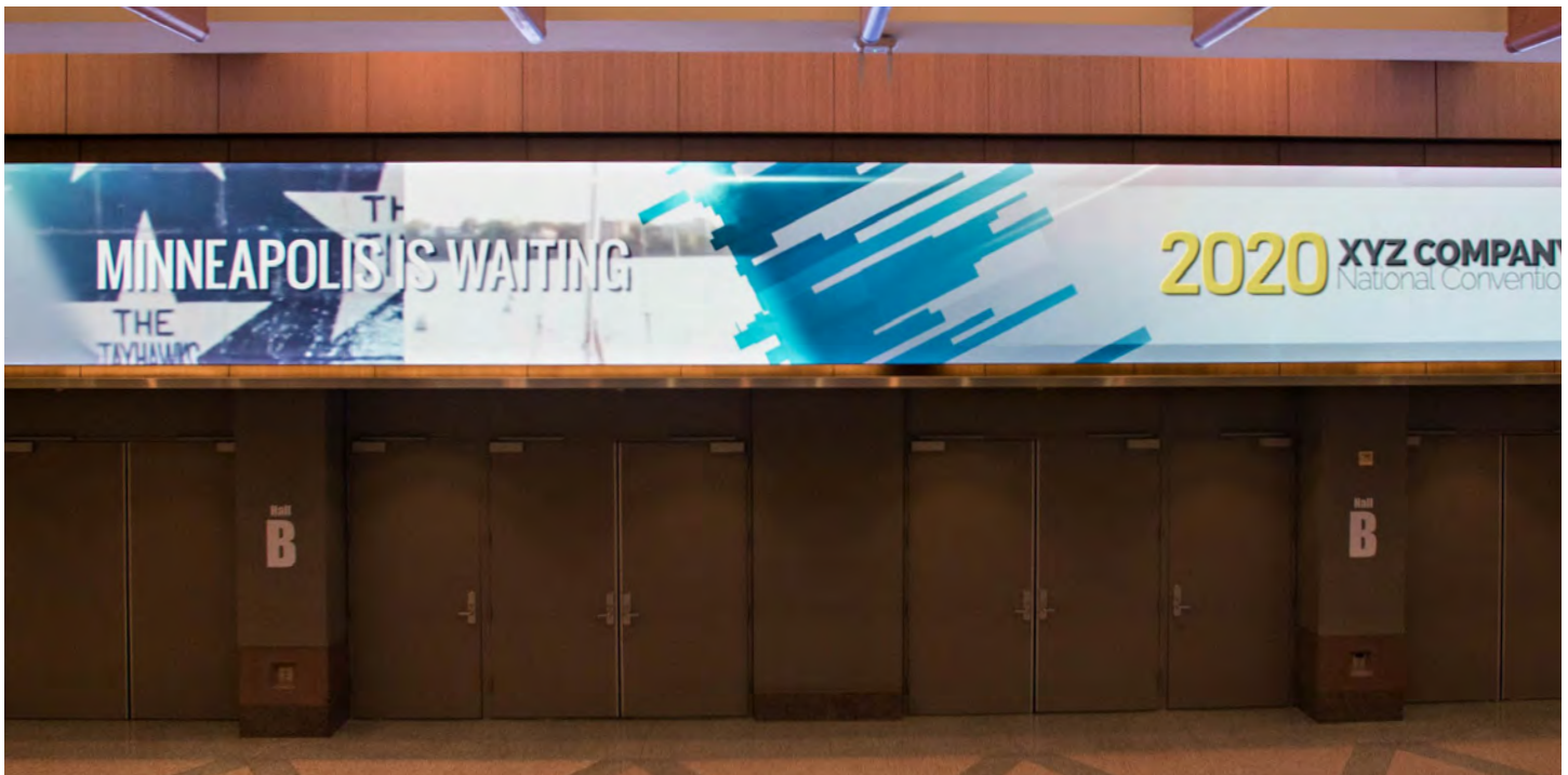
EXHIBIT HALL VIDEO WALLS