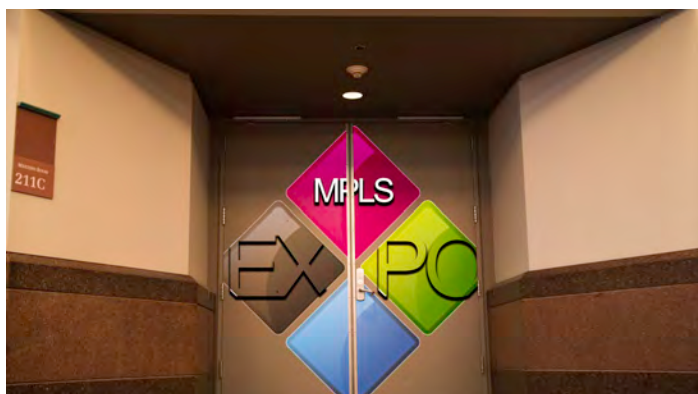
MEETING ROOM DOORS