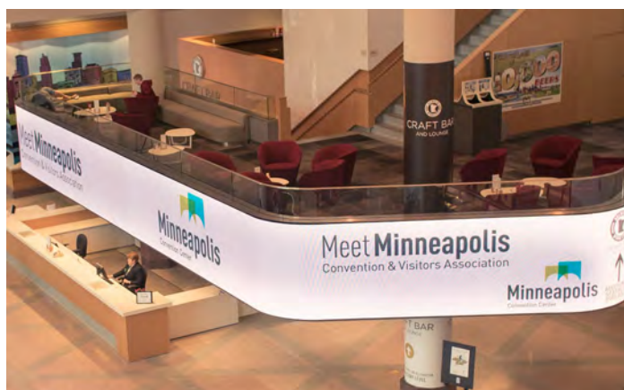
VISITOR INFORMATION CENTER VIDEO SCREEN