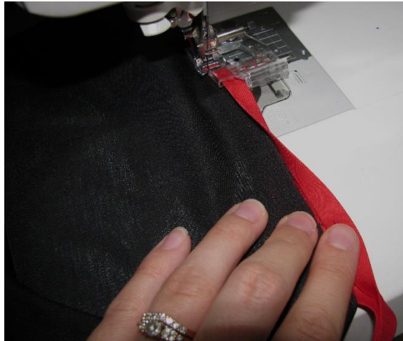
It should look similar to the image below.