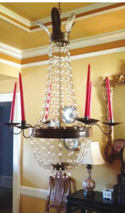
This chandelier, dating to the early 19th century, collapses for convenient storage when one is traveling - in style.

Roughly six hours into our trip, we decided to stop in Hudson, New York. This was the early days of Hudson’s now-famous chic shopping district. We moseyed down quiet sidewalks, refreshed ourselves at a local bakery, noticed small town charms and walked through well-curated shops. In one of these beautiful ateliers, I fell in love with the campaign chandelier, which dates back to the early 1800s. After a wire transfer of