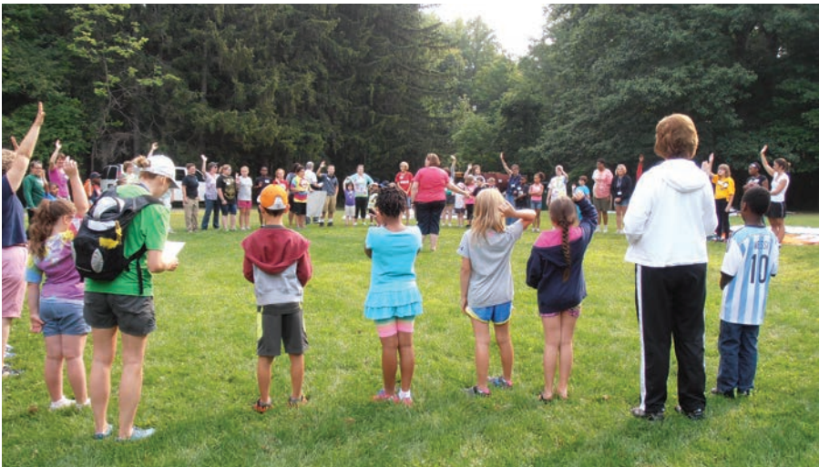
Children and counselors gather to get acquainted and sing camp songs on the first day of “Together We Can.”

Support is available for children ages 8-14 who are coping with the death of a loved one. “Together We Can Overnight,” a children’s grief support camp hosted by Hospice of the Western Reserve, is planned from Saturday, Oct. 15, 9:30 a.m., to Sunday, Oct. 16, 10:15 a.m., at Red Oak Camp, 9057 Kirtland-Chardon Rd., Kirtland. For the convenience of families from Fairview Park, Rocky River, West Park and surrounding west side communities, camp transportation will be provided from the Holiday Inn, 4181 W. 150th Street. Drop off times and additional camp details will be included in registration packets. The registration fee is $25 per camper; scholarships are available. Space is limited and completed registrations are due by Monday,