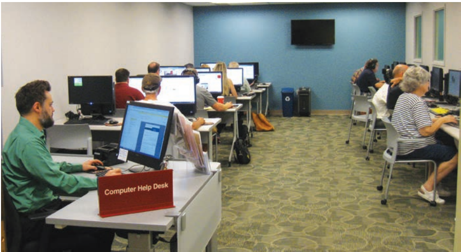
Rocky River Public Library’s Computer Center was recently renovated.

Also, the Library’s Computer Training Center, a beautiful state-of-the-art environment for educating our patrons, has been upgraded with a widescreen format digital projector with a new screen to match! •