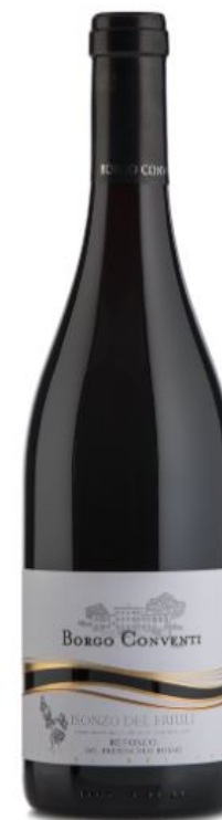
Refosco dal Peduncolo Rosso