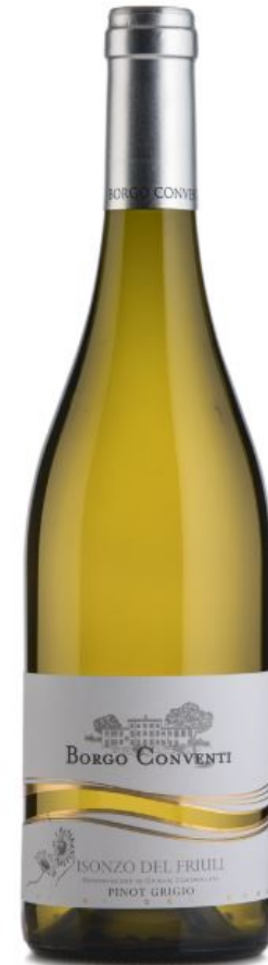
I Fiori del Borgo