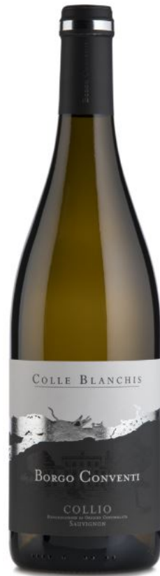
Sauvignon Colle Blanchis