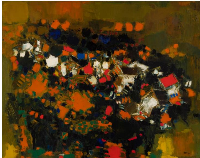
Lot 20: S H Raza, Paysage , 1960

Oil on canvas, 44.75 x 57.5 in (113.7 x 146 cm)