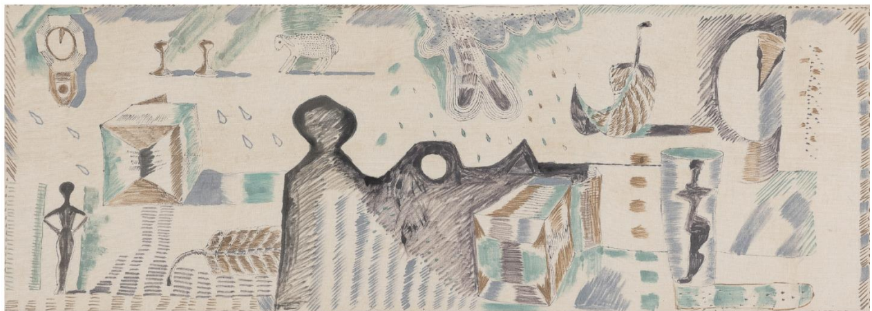
Lot 36: Prabhakar Barwe, Untitled

Watercolour and sketchpen on cloth, 31.75 x 90.75 in (80.4 x 230.3 cm)