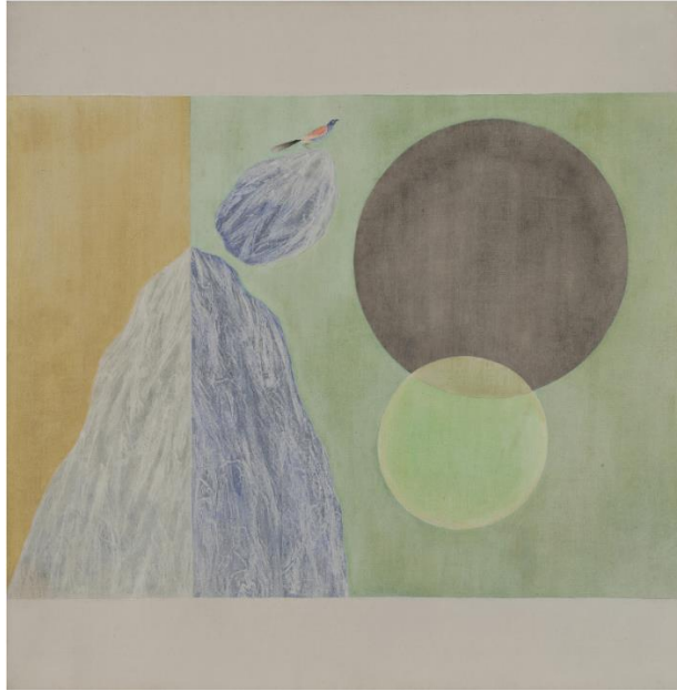
Lot 55: Jagdish Swaminathan, Untitled , circa 1970s

Oil on canvas, 50 x 50 in (126.8 x 126.8 cm)