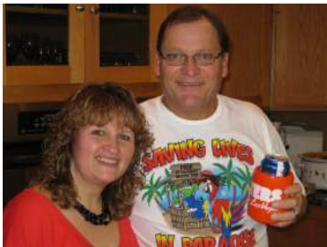
New Years Party 2011