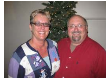
Club Holiday Party 2011