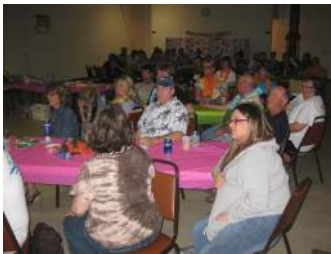
Pictures from Our 13th Birthday Party