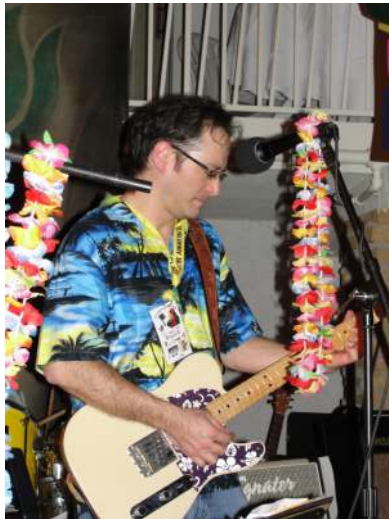
More Pictures from This Hotel Room Phlocking