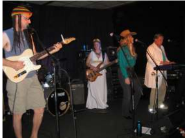
More great pictures of the Halloween Party