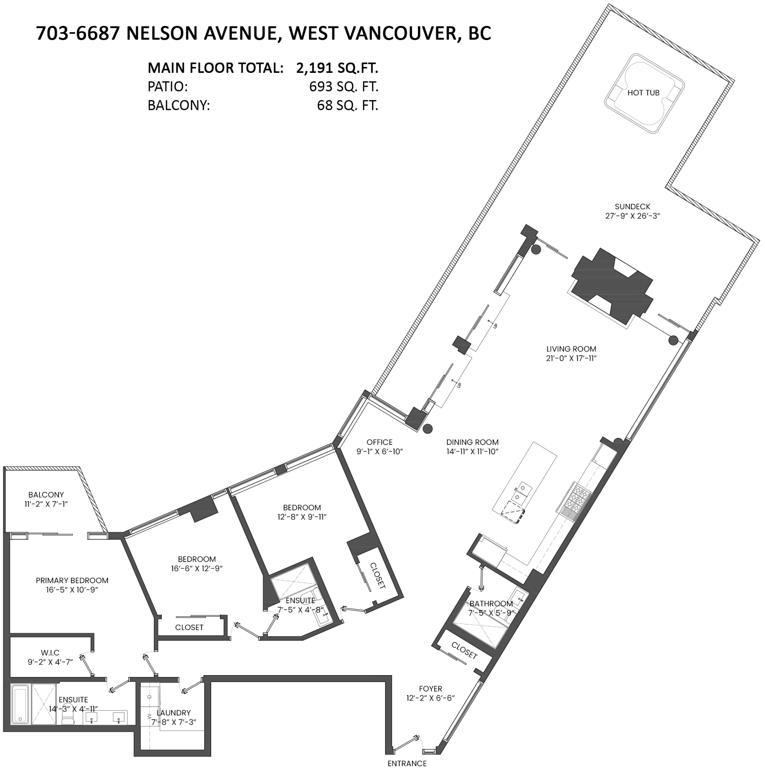
MAIN FLOOR PLAN Ceiling Height: 9'-7"

MAIN FLOOR TOTAL: 2,191 SQ.FT. PATIO: 693 SQ. FT. BALCONY: 68 SQ. FT.