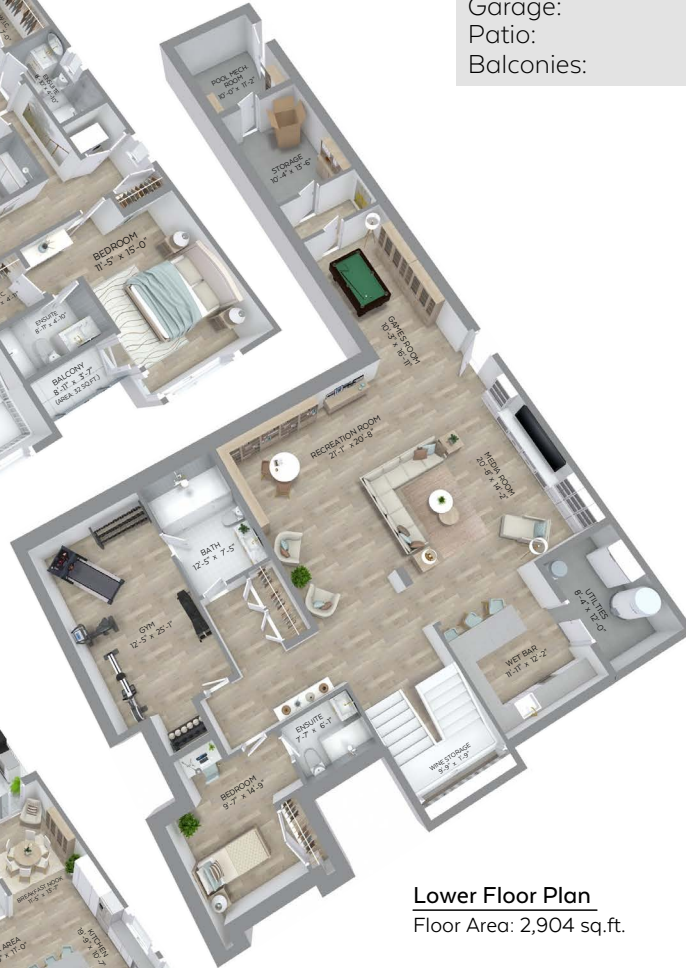
Lower Floor Plan Floor Area: 2,904 sq.ft.