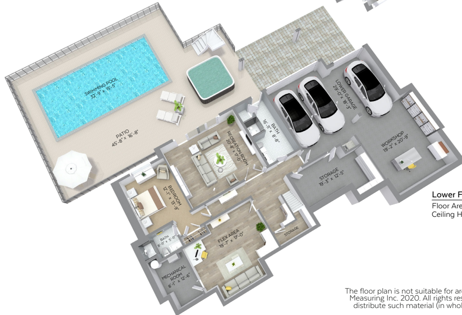
Lower Floor Plan Floor Area: 1,812 sq.ft. Ceiling Height: 8'-3"