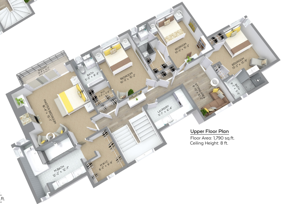
Upper Floor Plan Floor Area: 1,790 sq.ft. Ceiling Height: 8 ft.

The floor plan is not suitable for architectural/construction and is covered under E&O. © Excelsior Measuring Inc. 2020. All rights reserved for Excelsior Measuring Inc. Users shall not publish and distribute such material (in whole or in part) and/or incorporate it in other works in any form.