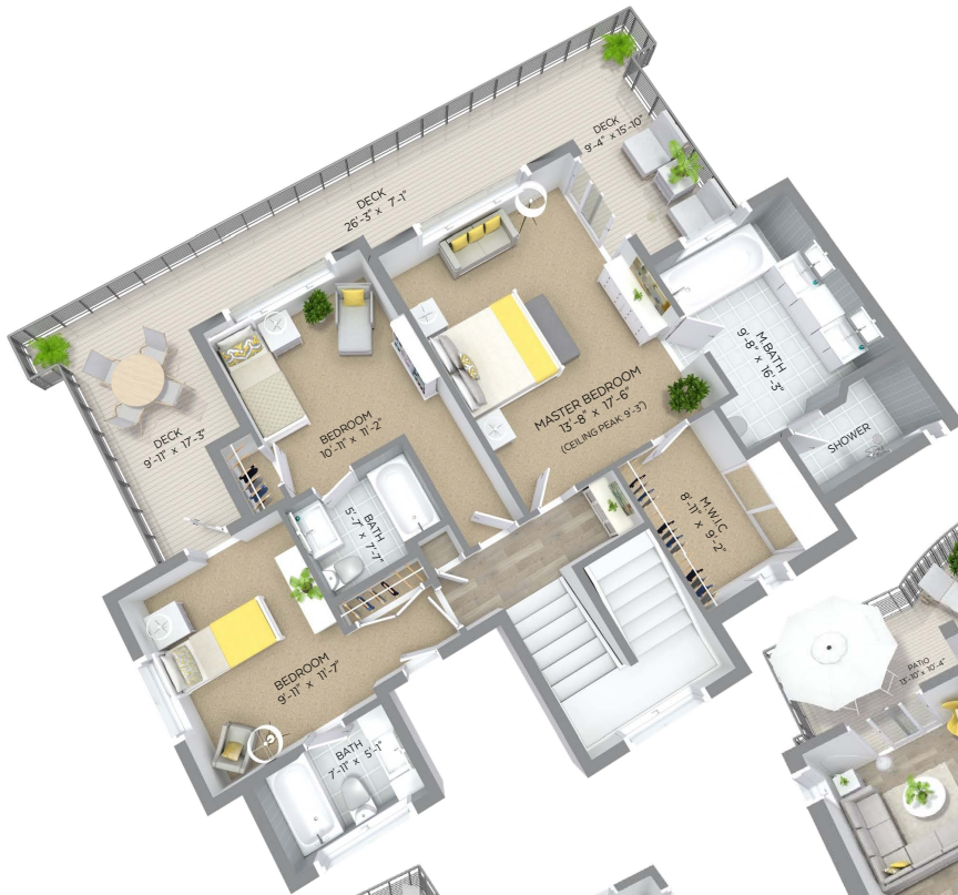
Upper Floor Plan Floor Area: 1,135 sq.ft. Ceiling Height: 8 ft. unless noted