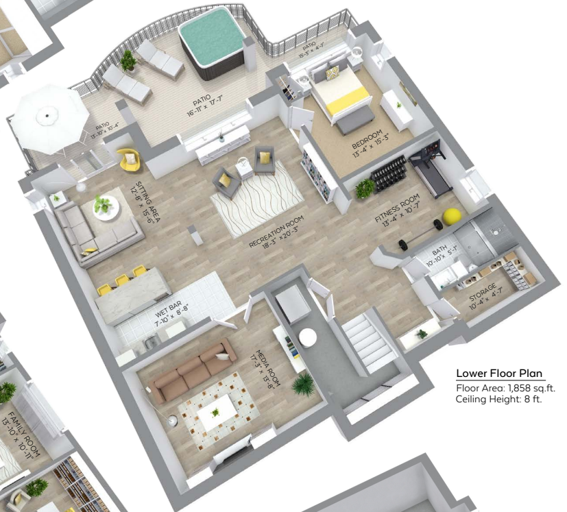
Lower Floor Plan Floor Area: 1,858 sq.ft. Ceiling Height: 8 ft.