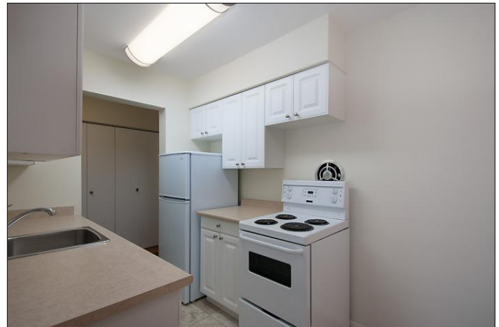
TYPICAL KITCHEN LAYOUT