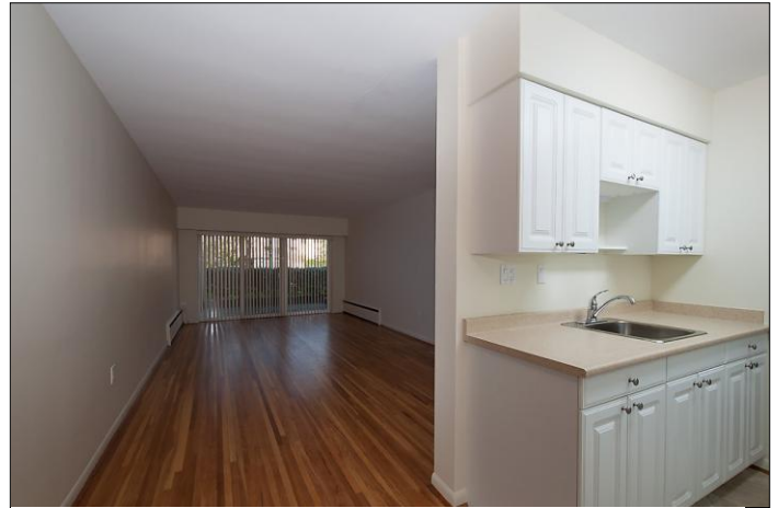
TYPICAL KITCHEN & LIVING ROOM LAYOUT