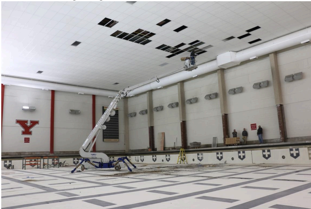
Can be put into an empty pool