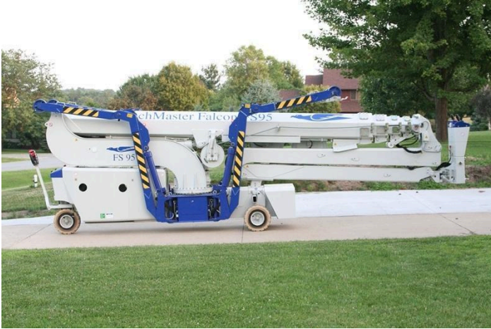
Stowed Atrium Manlift. FS95