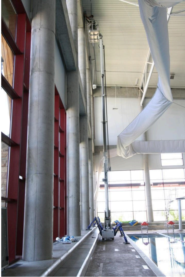
Narrow 8.5' setting reaching up 95'