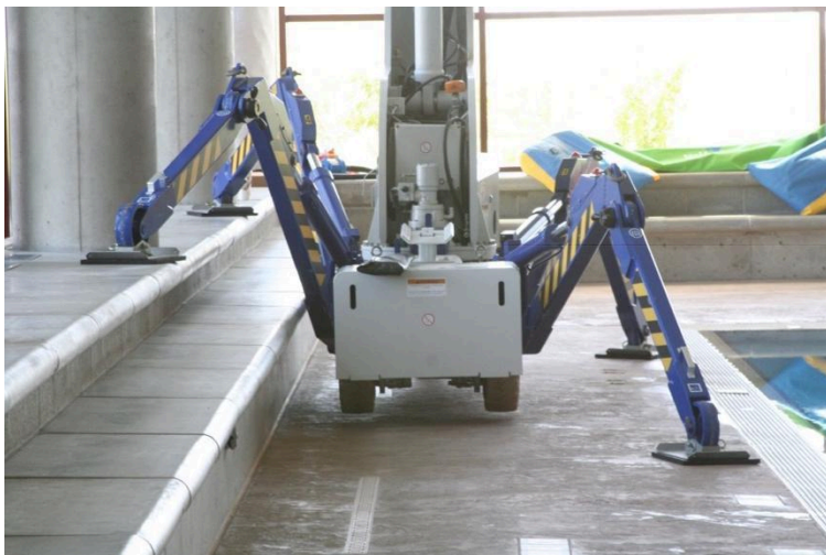
Narrow 8.5' setting on different levels of support.