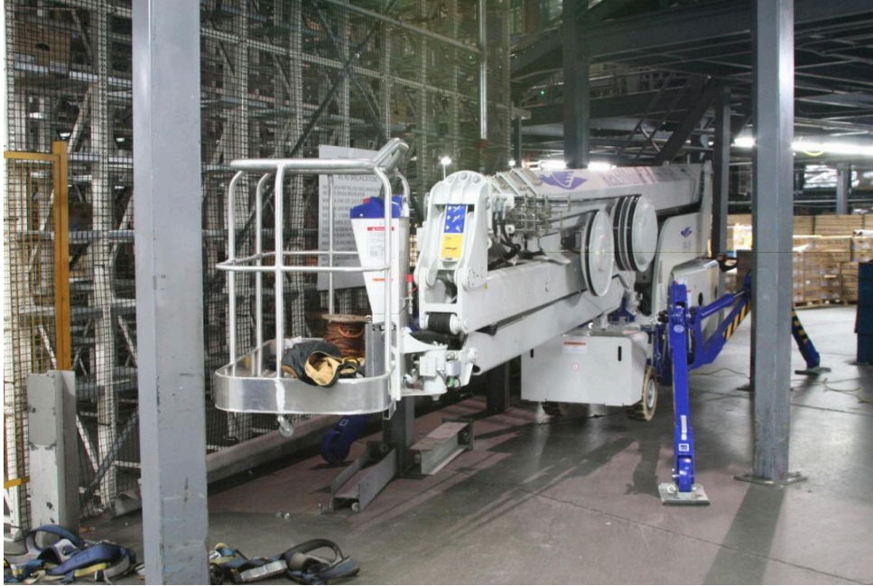
Narrow 8.5' setting fitting between structure.