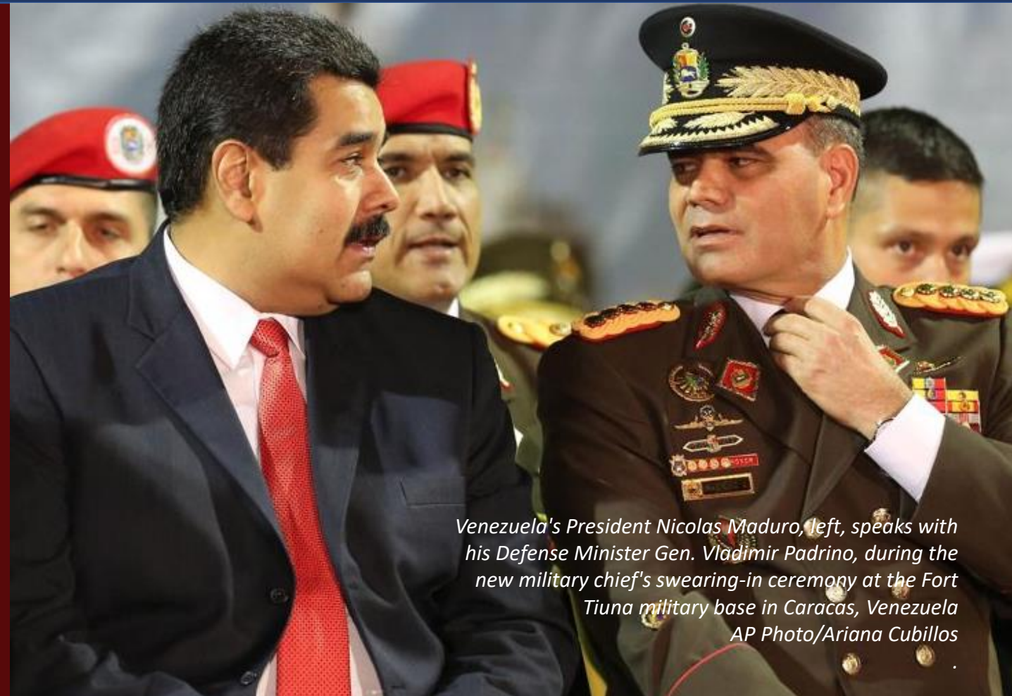
Venezuela's President Nicolas Maduro, left, speaks with his Defense Minister Gen. Vladimir Padrino, during the new military chief's swearing-in ceremony at the Fort Tiuna military base in Caracas, Venezuela