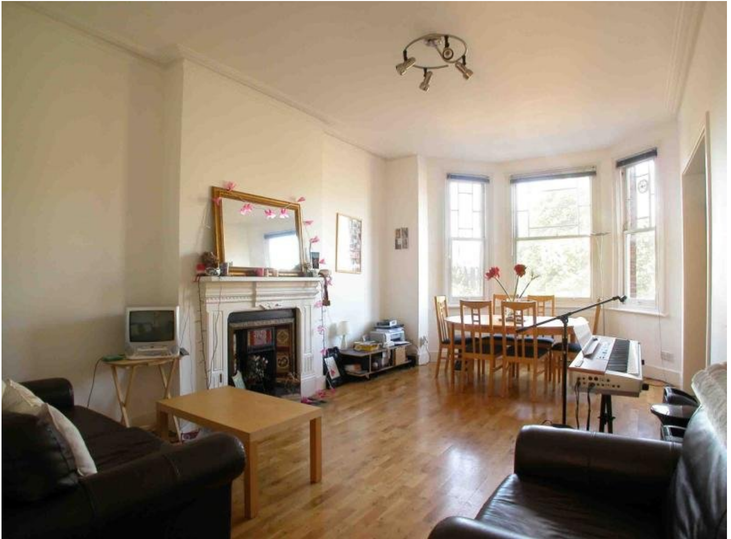
Fairhazel Gardens, South Hampstead