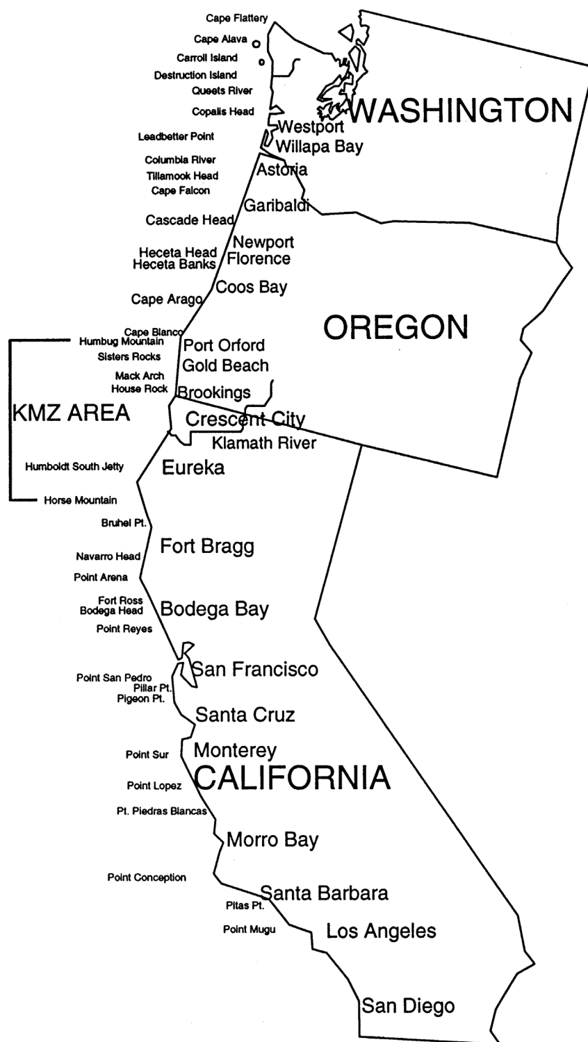
Figure 5. Ocean salmon fisheries management landmarks.