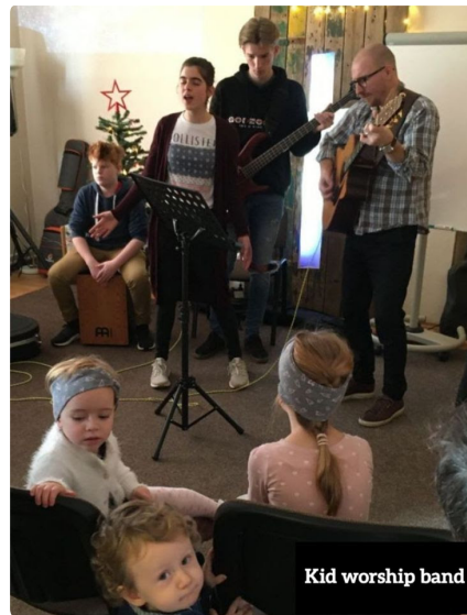
Kid worship band