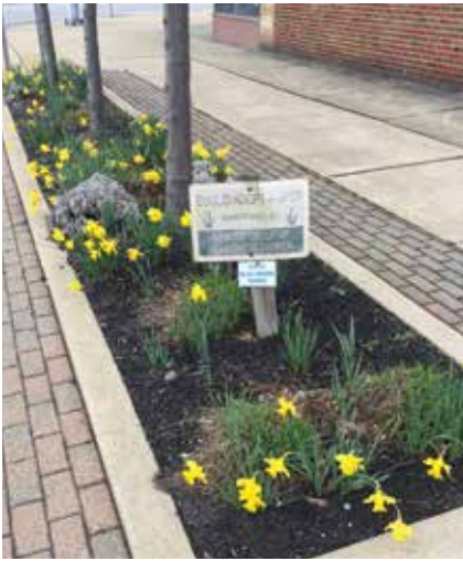
Adopt-A-Spot at the corner of E. 200th Street and Lakeshore Blvd.

Development Block Grant. Various neighborhoods are receiving trees along their streets to increase the tree canopy throughout our City. This project follows last Fall's tree planting of 330 trees, the largest planting to date. This Spring, 145 trees are being planted. In addition to new trees, the Adopt-A-Spot program is back this Spring in coordination with Keep Euclid Beautiful. After a successful Big Clean, the City of Euclid looks better than ever and Adopt-A-Spots are a great way to showcase your gardening skills all while contributing to your City.