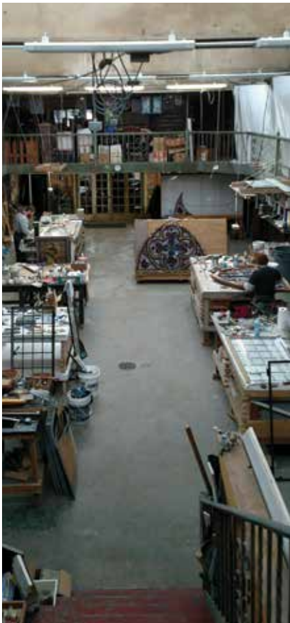
The glass-restoration workshop area