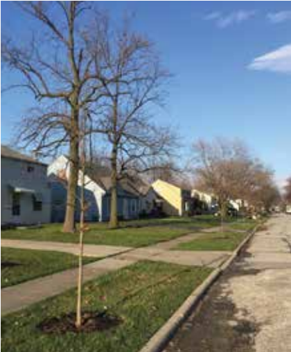
2018 Spring Tree Planting