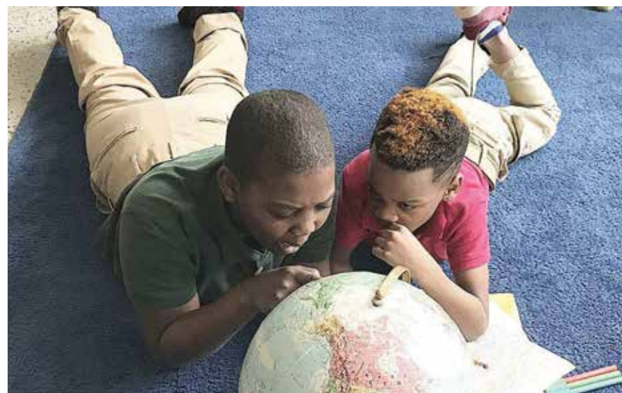
A Junior Cluster student guides a Primary Cluster student to finding a solution to the problem of the day.