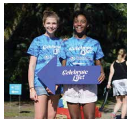
Enjoy a fun-filled day at the Zoo with family and friends while helping hospice families.