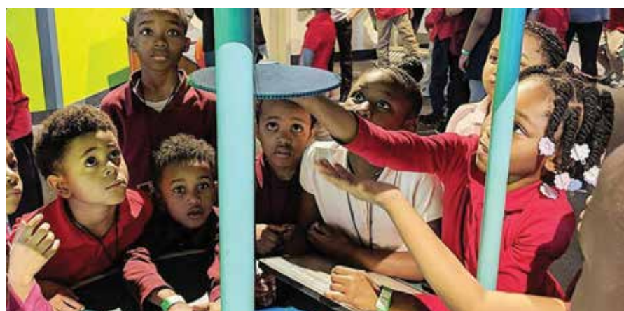
Amaze and wonder in action at the Great Lakes Science Center.

Cleveland MetroParks, the Great Lakes Science Center, Mitchell's Ice Cream, and the West Side Market. To end the year, we have two very exciting events. The first being our Spring Musical. This year we will be performing Aladdin. We are very happy and thrilled that La Salle Theater has agreed to partner with us as host for this event. The public is welcome to attend this showing on Thursday, April 17th at 6:00 pm. The last day of school for students is Friday, May 25th. We end every school year with field day; a fun afternoon of games and activities for the children. It's a wonderful way to celebrate the end of a year of learning and kick off summer.