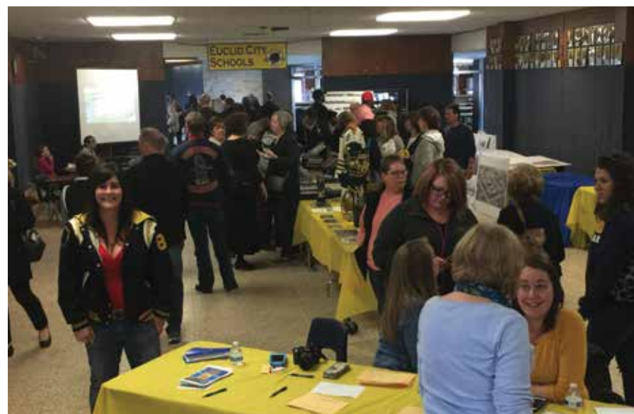
Hundreds of alumni gathered to pay their last respects to Euclid High School's E-Room.