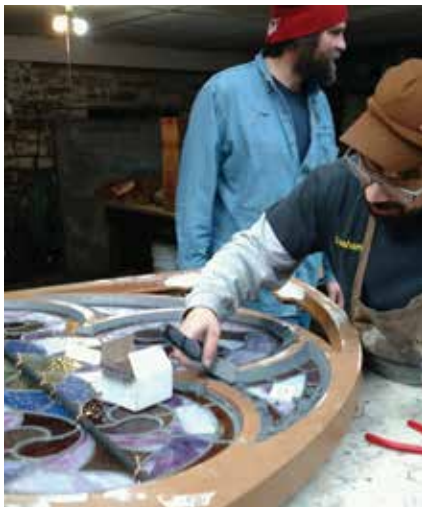
Restoration in progress