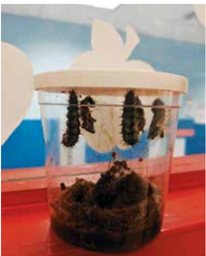
Caterpillars change to chrysalis stage.

Kindergarten students practice reading their writing to classmates. #KindergartenReads #WritingWorkshop Imagine Bella Academy of Excellence is now accepting applications for enrollment for the 2018-2019 school year! Enrollment packets and information available in the main office from 8-4:30. Kindergarten students who turn 5 by September 30th can follow the regular enrollment process using the application. Early Kindergarten Testing dates will be scheduled this summer for students with late birthdays. Students must pass test requirements and submit a parent referral. Students must turn 5 by December 31st, 2018. Please contact the school with any questions and to register for a test date. 216-481-1500.