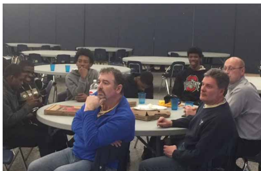
Alumni from the 1980s gathered with current members of the Euclid High School football team to share experiences, as well as pizza and soda in the E-Room.

The next day, during the E-Room Farewell event (the multi-purpose room will be torn down in June to make way for construction of a new, consolidated middle school), hundreds of eager alumni flooded the E-Room to take one last look at the place where homecoming dances, proms,