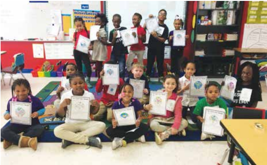
Happy Earth Day! First graders from Ms. Gura's class made an Earth Day Pledge. They pledged to honor Earth Day, not just on April 22nd, but every day. We can all make a difference!