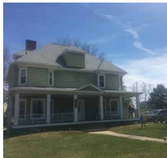
Spring has arrived at The Green House in Euclid. Stop by for a cup of tea or coffee, front porch seating coming soon!