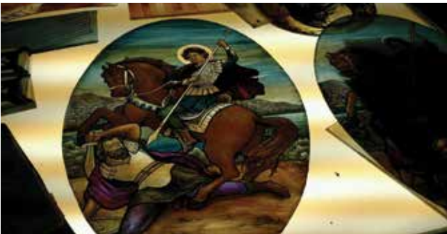
Custom handpainted glass