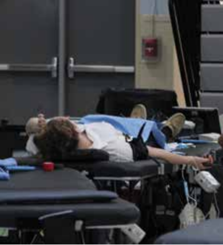
VASJ helped save 72 lives with blood drive.