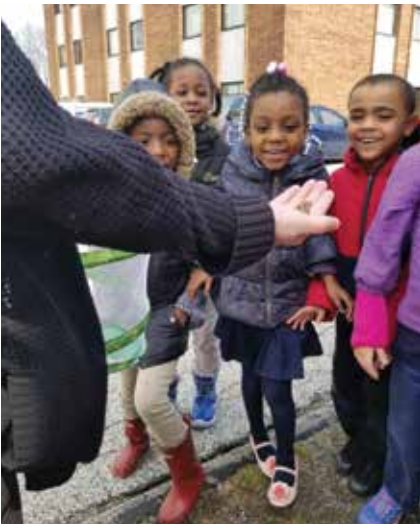
Time to fly free!

Kindergarten students watched caterpillars change to beautiful butterflies. So excited Spring is here!