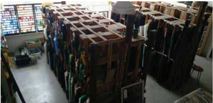
Replacement glass storage