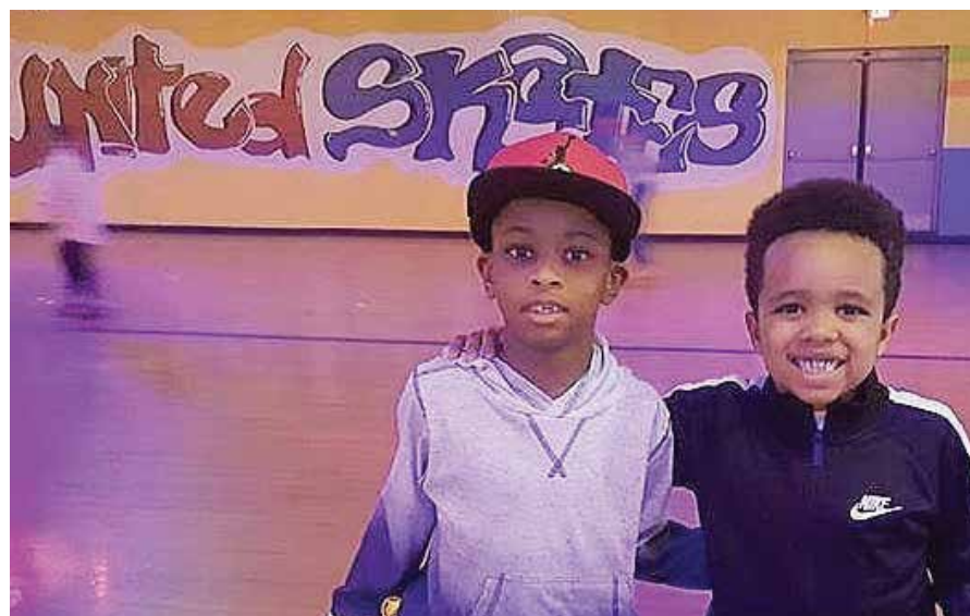
Family Group sponsored a family skate night at United Skates in Wickliffe. On May 12th, they are hosting an ice cream social at CP's Cooler.

While the year may be ending, we plan to end with a lot of fun and educational opportunities for our kids! Our students will celebrate the end of the year with their Intergenerational partners on their final IG visits of the year. All of our students will be attending a Lake County Captains baseball game (which was made possible through their Literacy Program). Junior Achievement will stop by to enthrall our students with economic activities. We will have a performance by the Cleveland School of the Arts Choir. Our field trip schedule is fully booked. We have trips planned to the