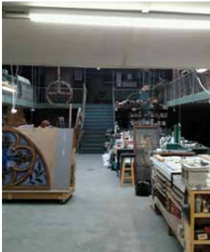
The main workshop area