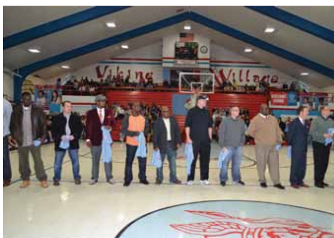
The VASJ 1992 boys basketball state champs were honored in the Viking Village on Friday, February 8, 2013.