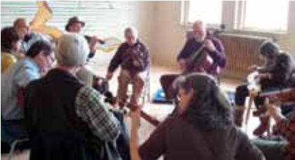
Music filled the air during the well-attended afternoon open jam session