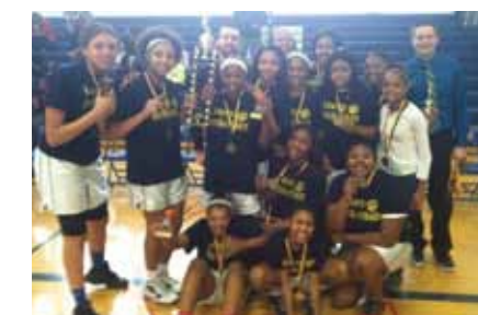
Congratulations Lady Lions! Champions of the Junior LEL beating Maple 44-21. We are Panther Proud!

CALL FOR YOUR APPOINTMENT 216-797-2933 REGISTRATION PACKETS AVAILABLE ONLINE AT WWW.EUCLIDSCHOOLS.ORG