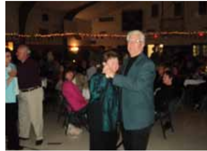
The evening will begin with a Polka Mass at 4 pm, music will be provided by the Don Wojtila Orchestra.

Dinner Passports (Tickets) are $40 a person; pre-sale tickets are available with a $5 discount ($35), if purchased by Sunday, March 17. Breakfast Passports are $10 for adults and $5 for children.