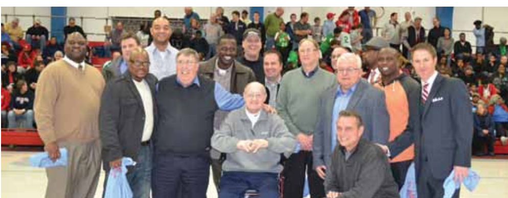
The VASJ 1992 boys basketball state champions and their coaches pose for a group picture.