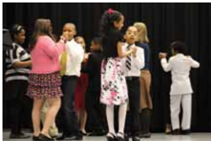
Dressed in their "Sunday best" students danced the merengue, waltz, foxtrot, tango, rumba, and swing.

dence, communicate and cooperate, and accept others even if they are different." This curriculum-based teaching approach included writing assignments after each lesson that are directly con-