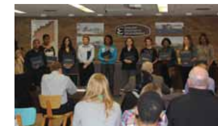
EHS Band Students were recognized at the Special Meeting of the Board of Education on February 25 for their participation and honors at the Ohio Music Educators Association Solo and Ensemble Contest.