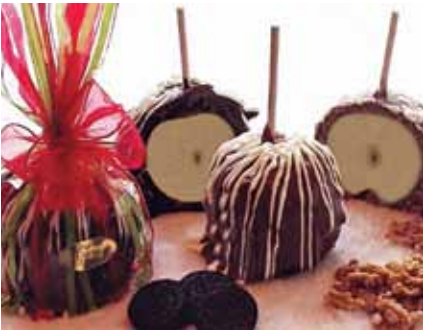
Cavotta's carries Carmen & Company Chocolate Novelties. Their fabulous gourmet caramel apples are to die for and were Voted #1 in Cleveland!

Cavotta's Garden Center will be hosting a Holiday Open House, from 11 am to 6 pm, Saturday, November 24. The Open House will feature everything Cavotta's is famous for: Fresh Christmas Trees, Holiday Wreaths, Vintage Christmas items. There will be lots of chocolate, along with our famous Gourmet Caramel Apples which have been rated Number One in the city of Cleveland.