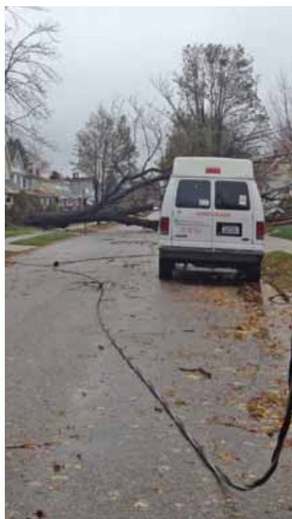
Damage from the storm.

Prior to and following the storm, we used Euclid's Blackboard Connect system to release messages throughout the entire city regarding preparation for the storm, power outages, suspension of recycling, curbside collection of