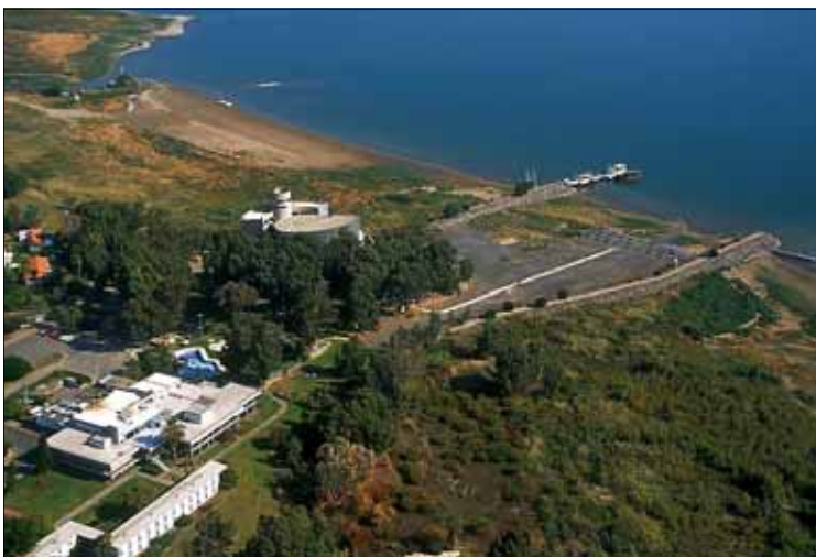
Nof Ginosar museum and harbor aerial