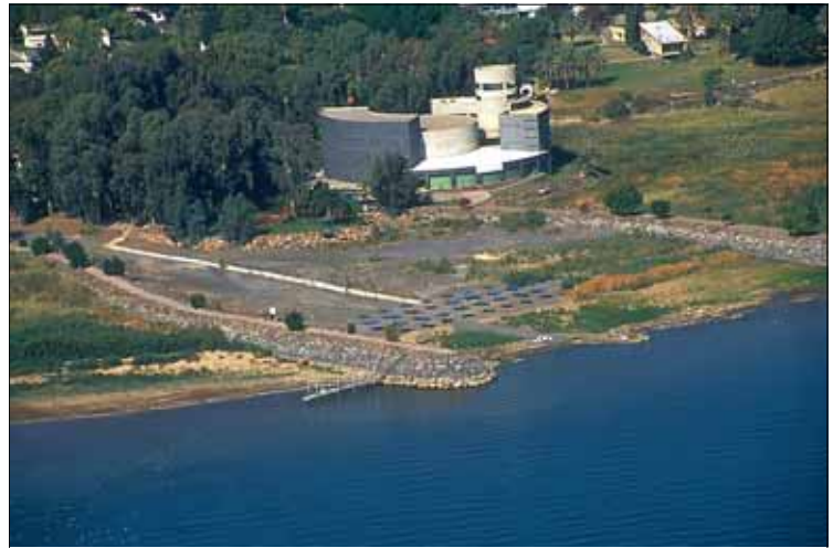
Nof Ginosar museum and harbor aerial