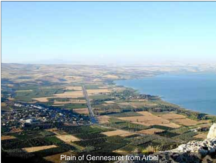
Plain of Gennesaret from Arbel