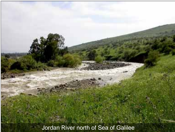
Jordan River north of Sea of Galilee