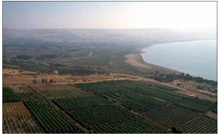
Bethsaida plain aerial from northwest