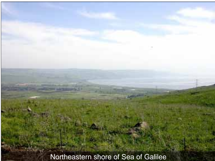
Northeastern shore of Sea of Galilee