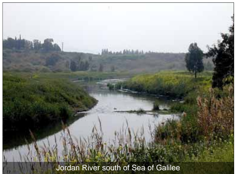
Jordan River south of Sea of Galilee