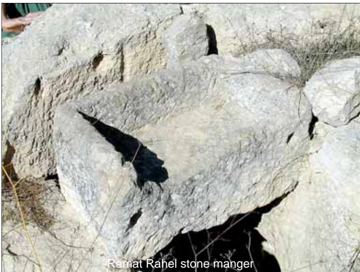
Ramat Rahel stone manger