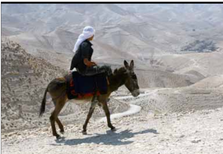
Transportation to Bethlehem