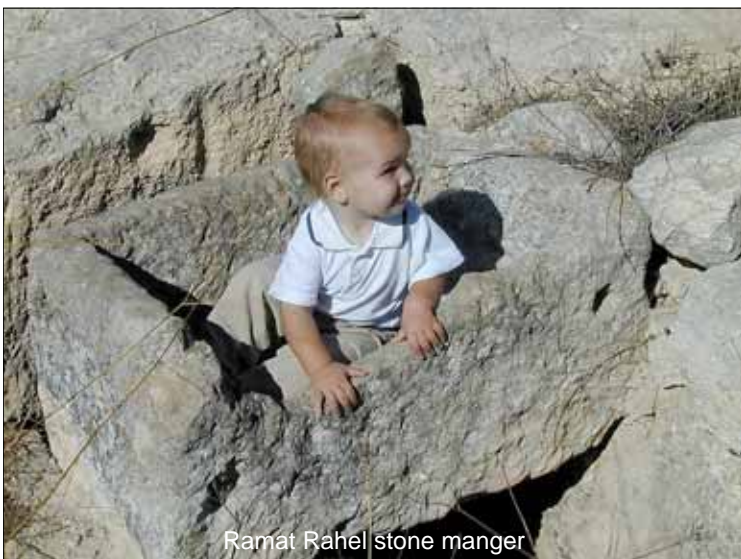
Ramat Rahel stone manger