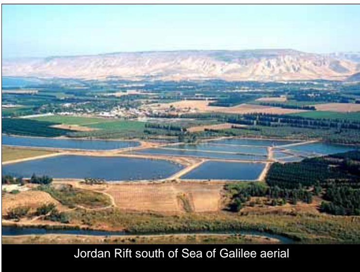
Jordan Rift south of Sea of Galilee aerial