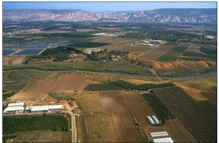
Jordan Rift and Yarmuk Valley aerial from west