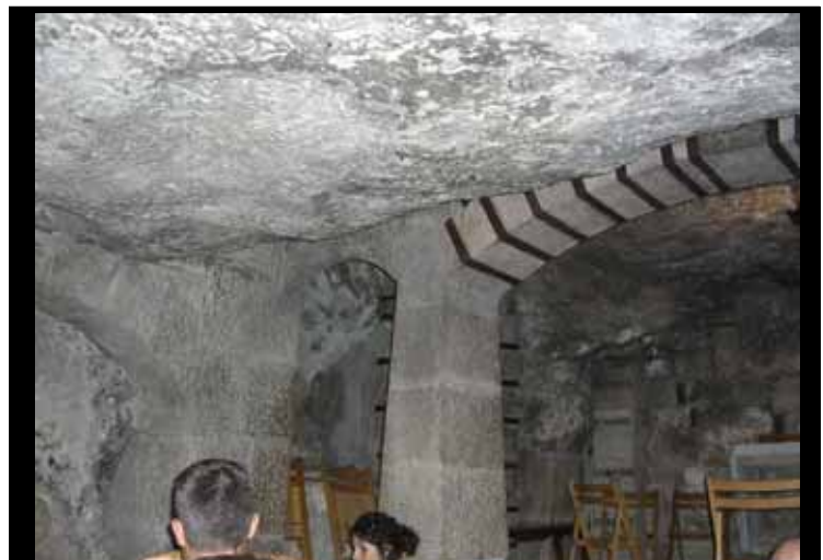
Adjacent Cave in the Church of Nativity