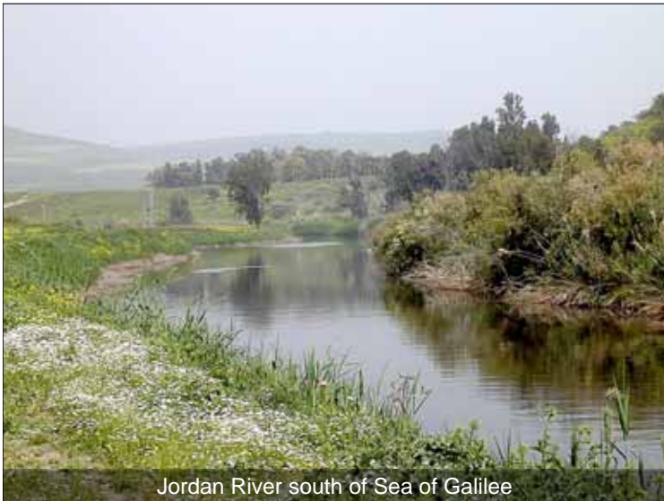
Jordan River south of Sea of Galilee