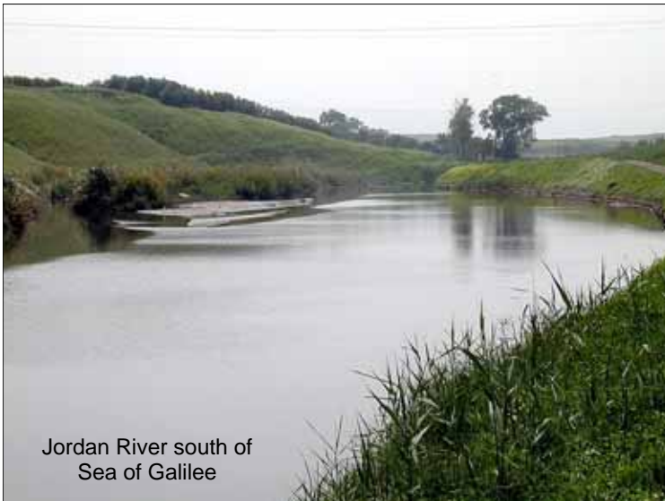
Jordan River south of Sea of Galilee