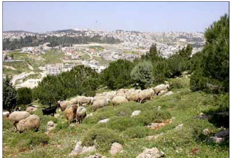
Sheep grazing near Nazareth