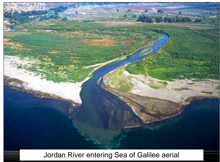
Jordan River entering Sea of Galilee aerial