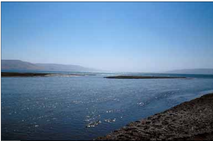
Place where the Jordan River enters the Sea of Galilee