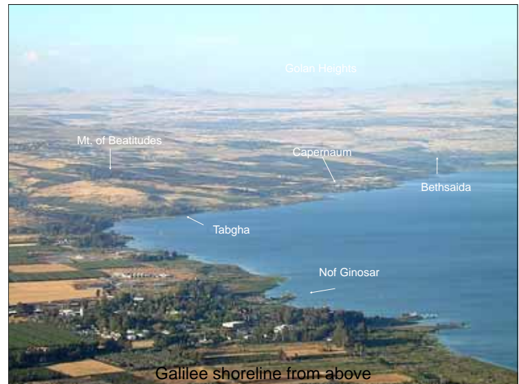
Galilee shoreline from above