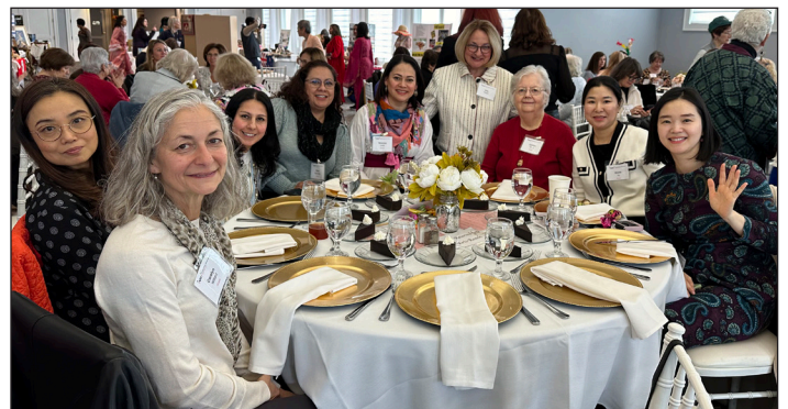
The International Friends members attended the International Women Indiana celebration luncheon on March 21.

Painting Club (and it's not just painting!) meets the second Saturday in Carmel room 101B starting after 10 AM (because most of us are in Taiji). This group is growing! On addition to our regular painters, some have started coming to crochet prayer shawls.