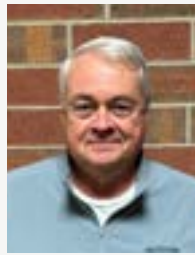
Richard Inman Endowment Committee