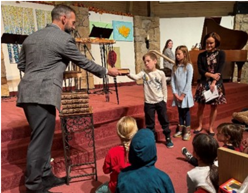
8:30 a.m. Service Bible Presentation