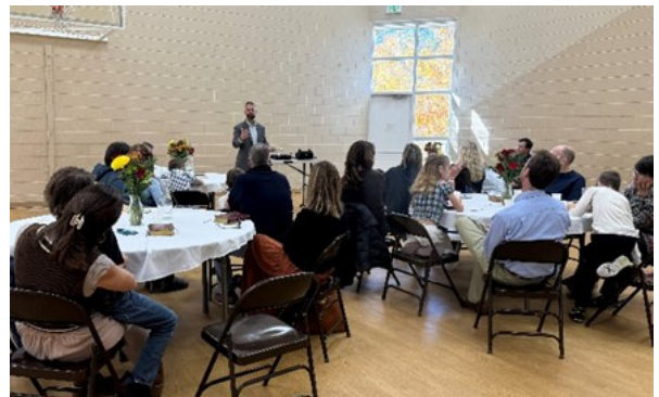
Reception with 3rd graders and their parents.