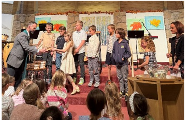
11 a.m. Service Bible Presentation