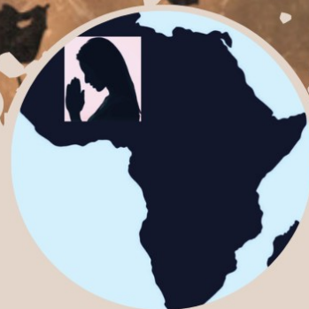
Missions Spotlight CAC Worker in W. Africa