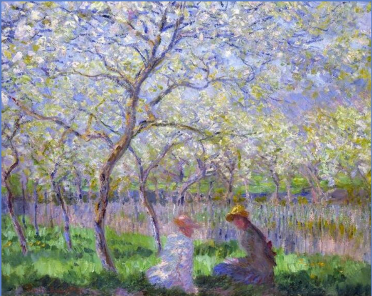
Monet, Springtime , 1886. Oil on canvas, 64.8 x 80.6 cm. Cambridge: Fitzwilliam Museum.