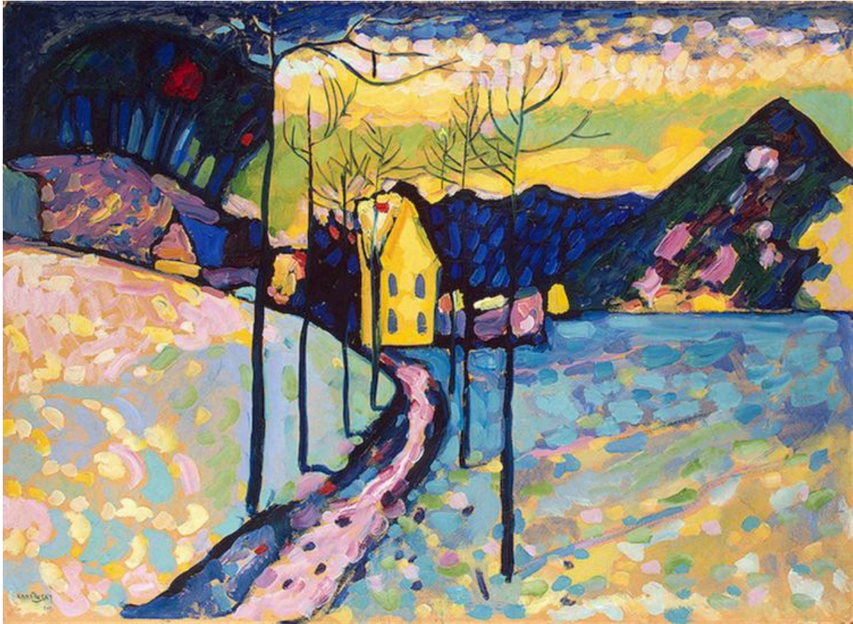
Winter Landscape, 1909. Wassily Kandinsky

"But I have calmed and quieted my soul..." Psalm 131:2