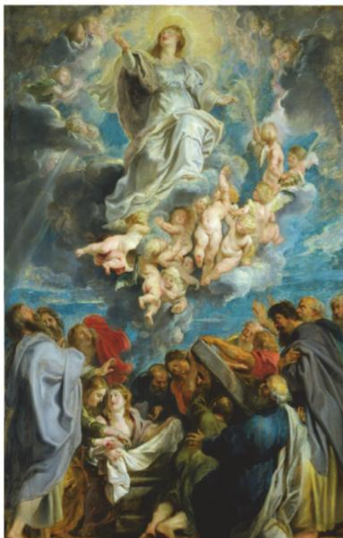
Rubens: Assumption of the Virgin,