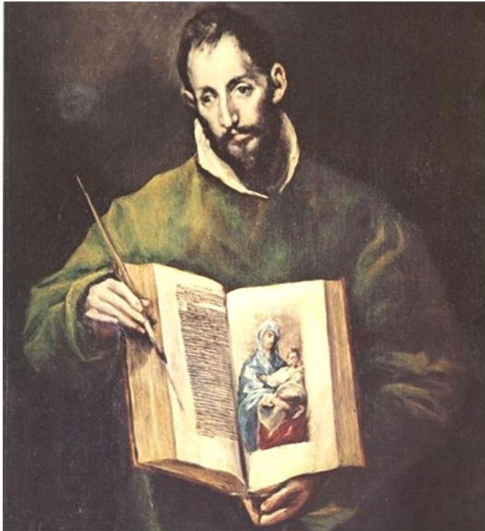
El Greco's painting of St. Luke's painting of Mother & child.

they would learn the humility of the Most Blessed Virgin,” – “Who trusted that the Lord’s word in her would be fulfilled.”