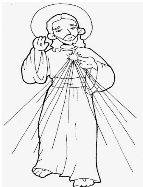
Colorea a Jesús Divina Misericordia