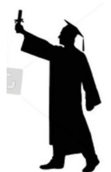
Graduates from Avon Park H.S. wore red cap & gowns: Graduates from Frostproof H.S. wore Black cap & gowns.