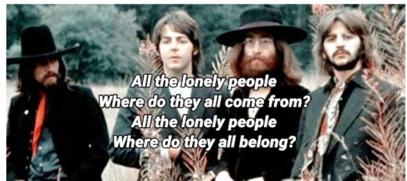
Beatles, Eleanor Rigby, “Look at all those lonely people...”

The “Heart” is the symbol and Source of God’s love. John’s 1st Letter describes God as, “God is love.” We are created “in the image and likeness of God,” a God who is love. John’s challenge, “Let us love one another, because love is of God.” God revealed his love “in the flesh” when he “sent his only begotten Son into the world.” The challenge