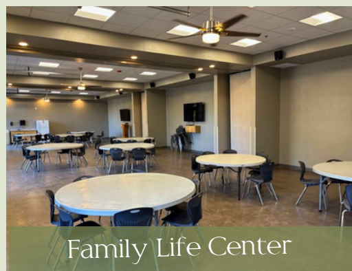
Family Life Center