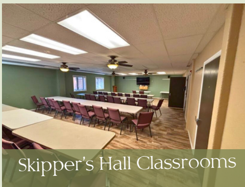
Skipper's Hall Classrooms