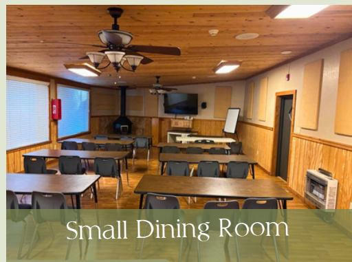
Small Dining Room