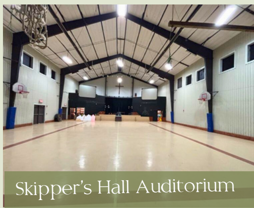
Skipper's Hall Auditorium