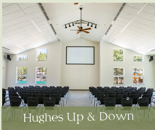
Hughes Up & Down