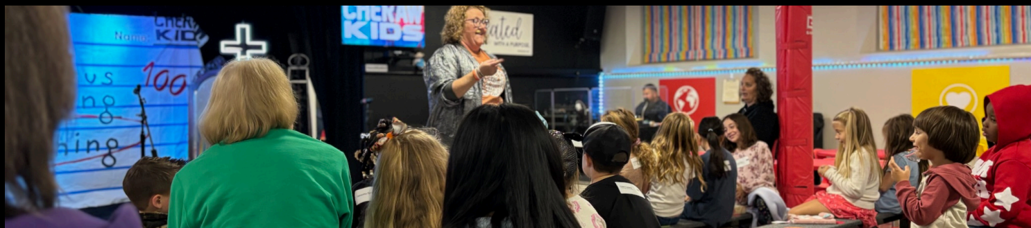
Sunday PM Service Time