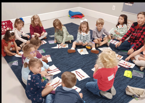
Sunday AM Bible Learning